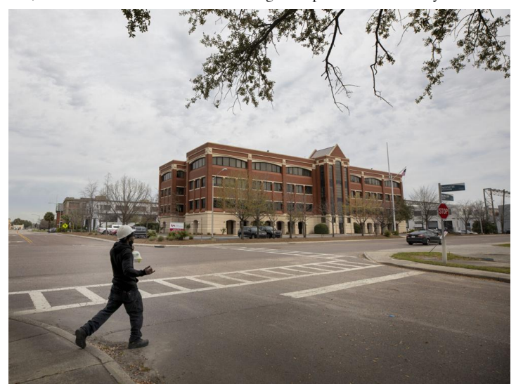
The buildings along Noisette Boulevard on the former Charleston Naval Base in North Charleston are part of a large, new redevelopment project called Navy Yard Charleston.

GRACE BEAHM ALFORD GBEAHM@POSTANDCOURIER.COM